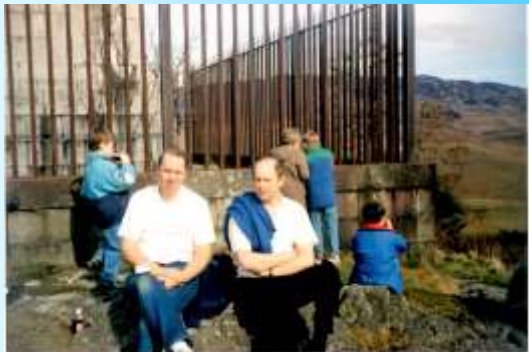
BB Jun Sect at Nth Berwick and Millport